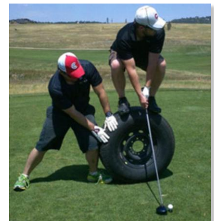
Golf Charity Event for YMCA

Add'l representatives may attend for $20 pp.