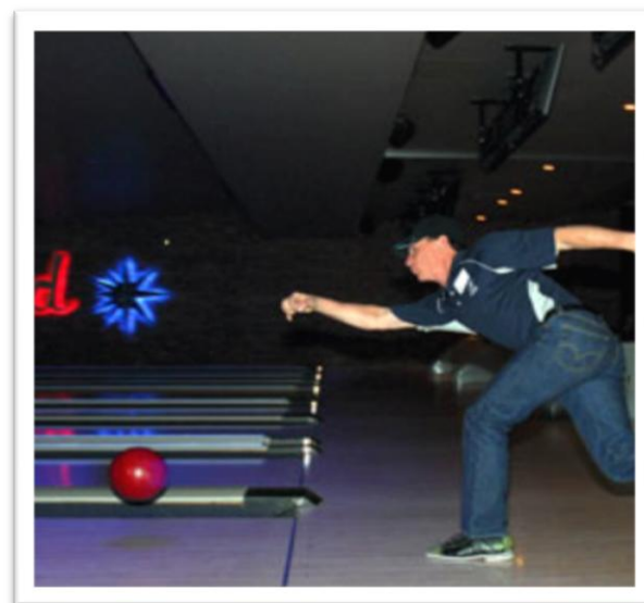
Bowling Charity Event for Freedom Hunters

BOAC also supports the Volunteers of America, building a better tomorrow for families in our communities. In addition we donate to the HOPE House, Habitat for Humanity, Field of Dreams, and the local YMCA.